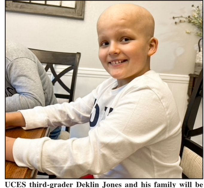
honored at the 28th Annual Union County Relay For Life on Saturday.

Their Relay For Life Team has recently revived one of their most meaningful fundraisers. Last Sunday after services, church members, guests and Kelay For Life volunteers served a delicious for those bidders who were not opening lap around the luncheon and held a very tempted by the sweets! perimeter of the Farmers successful auction of desserts and cakes along with some American Cancer Society